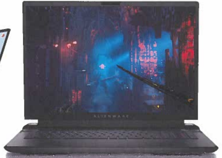
Alienware m18 Gaming Laptop

Now that you're enrolled in the Dell Member Purchase Program, your benefits include: