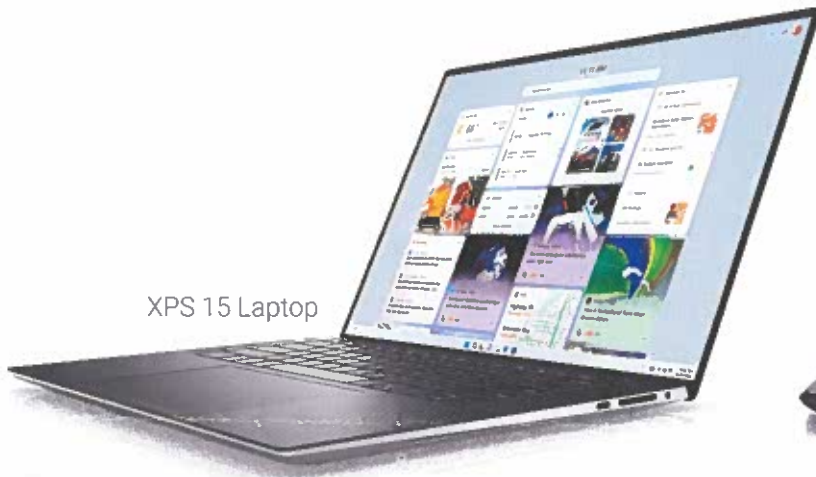
XPS 15 Laptop

Introducing our new offer - save an additional 5% on Dell.com orders with an exclusive coupon, available at your Dell link below